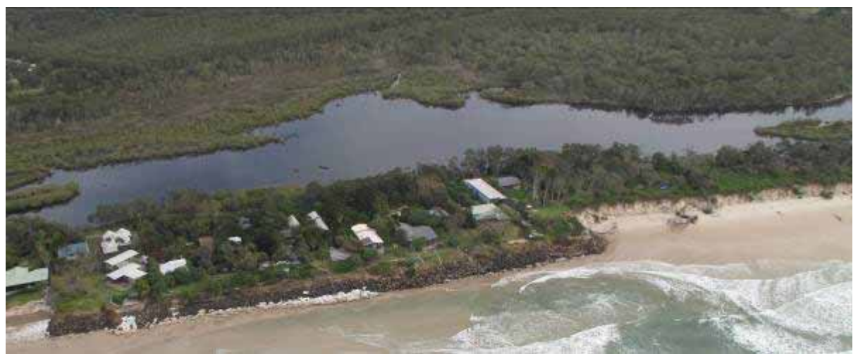
Seawalls and coastal erosion at Belongil Beach, Byron Bay

Linear interpolation between the 1990 base sea level and the 2050 and 2100 sea level rise benchmarks can be used to estimate projected sea level rise for coastal planning horizons or asset life other than those corresponding to the benchmark years. For consideration of sea level rise beyond 2100, an additional 0.1 m per decade allowance can be used above the 2100 benchmark level. This approach assumes a linear rise beyond 2100 at rates equivalent to that projected for the last decade of the twenty-first century (2090–2100) and is consistent with the approach adopted in New Zealand (Ministry for the Environment 2008).