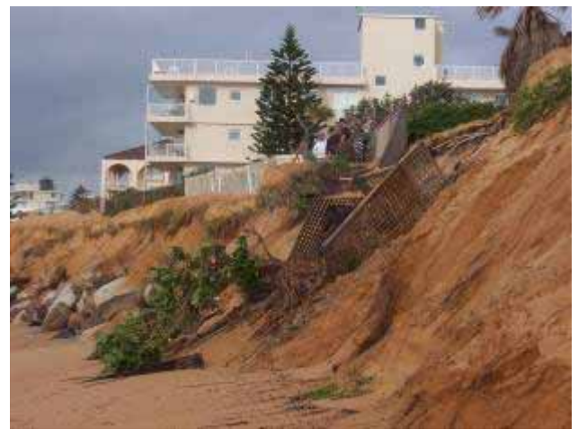
Coastal erosion at Collaroy/Narrabeen beach

It is widely acknowledged that unconsolidated (or erodible) shorelines will recede in response to an incremental rise in mean sea level over time. Bruun (1962, 1988) proposed a simple two-dimensional estimate the amount of model to associated shoreline retreat which can be approximated as the product of the active profile slope and the amount of sea level rise. There are limitations associated with the Bruun Rule for use throughout the coastal zone for determining foreshore recession due sea level to rise (Ranasinghe et al. 2007). Nevertheless, until more sophisticated methodologies are available, the Bruun Rule approach is recommended for estimating the likely width of shoreline recession attributable to sea level rise.