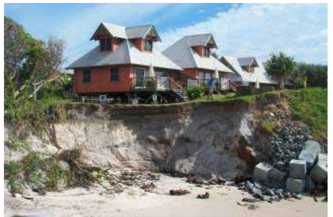
Coastal erosion at Belongil Beach, Byron Bay

The adaptation to sea level rise will require careful planning and management into the future in order to minimise social, environmental and economic impacts.